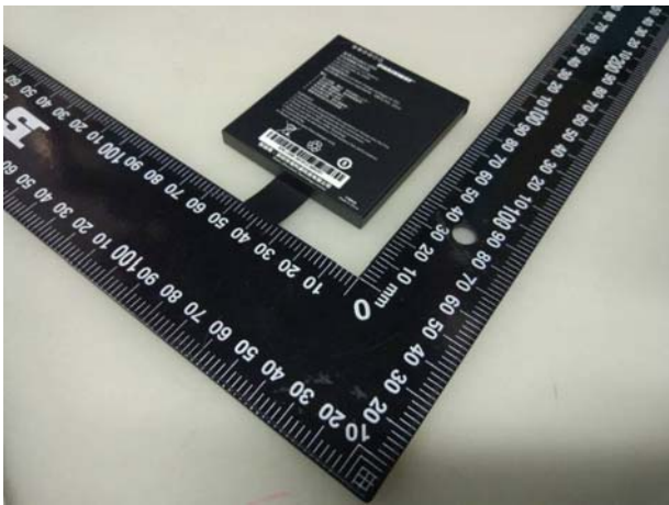
电池/ Battery(J295 3,8V 4300mAh)